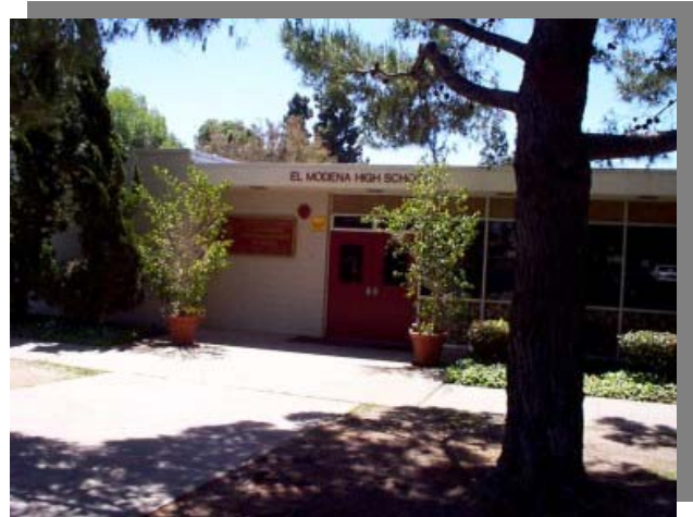
El Modena High School