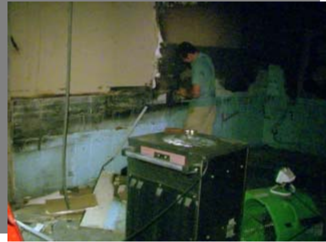
Crews are cleaning up following Saturday's fire at Argos Community Schools. Classes will resume Wednesday on a 2-hour delay.

ARGOS, IN| School will resume Wednesday at Argos Junior Senior High School after a fire over the weekend forced the cancellation of classes for two days.