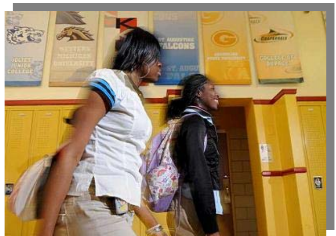
Chicago Public School students surveyed 400 teens on such matters as discipline, teacher quality, school culture and curriculum.