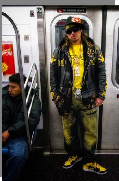
ALK member on the NYC Subway

Basic Gang History: The Latin Kings are the oldest and largest Hispanic-led gang in existence. The gang was formed in the mid-1950s or 1960s in the Humboldt Park neighborhood of Chicago as a way for Hispanics to defend themselves from encroaching African American gangs. Latin Kings are thought to exist in 34 states. Their mottos are " Once a King, always a King " and " Cowards die many times before their death; Latin Kings never taste death, but once... " The primary symbol of the gang is the five-point star and the colors black and gold.