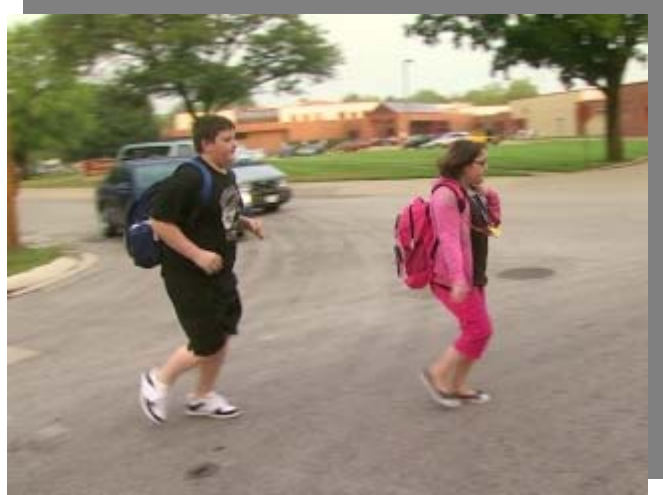
In the wake of budget cuts, more kids are crossing streets without crossing guards on their way to school.

On the first day of school at a busy intersection near Thomas Edison Intermediate Center, WSBT News saw several kids crossing but no crossing guard.